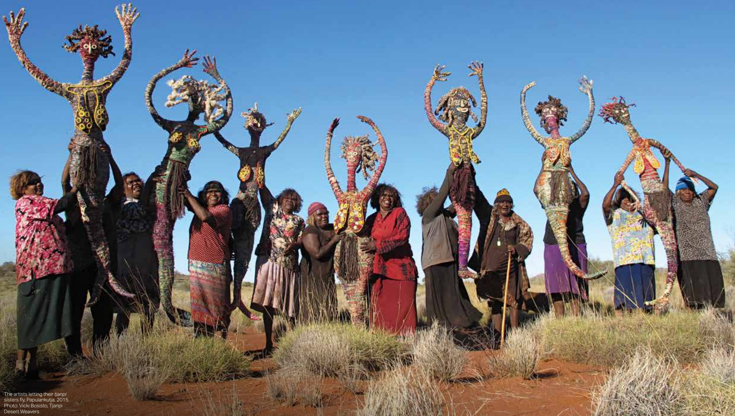
The artists letting their tjanpi sisters fly, Papulankutja, 2015.