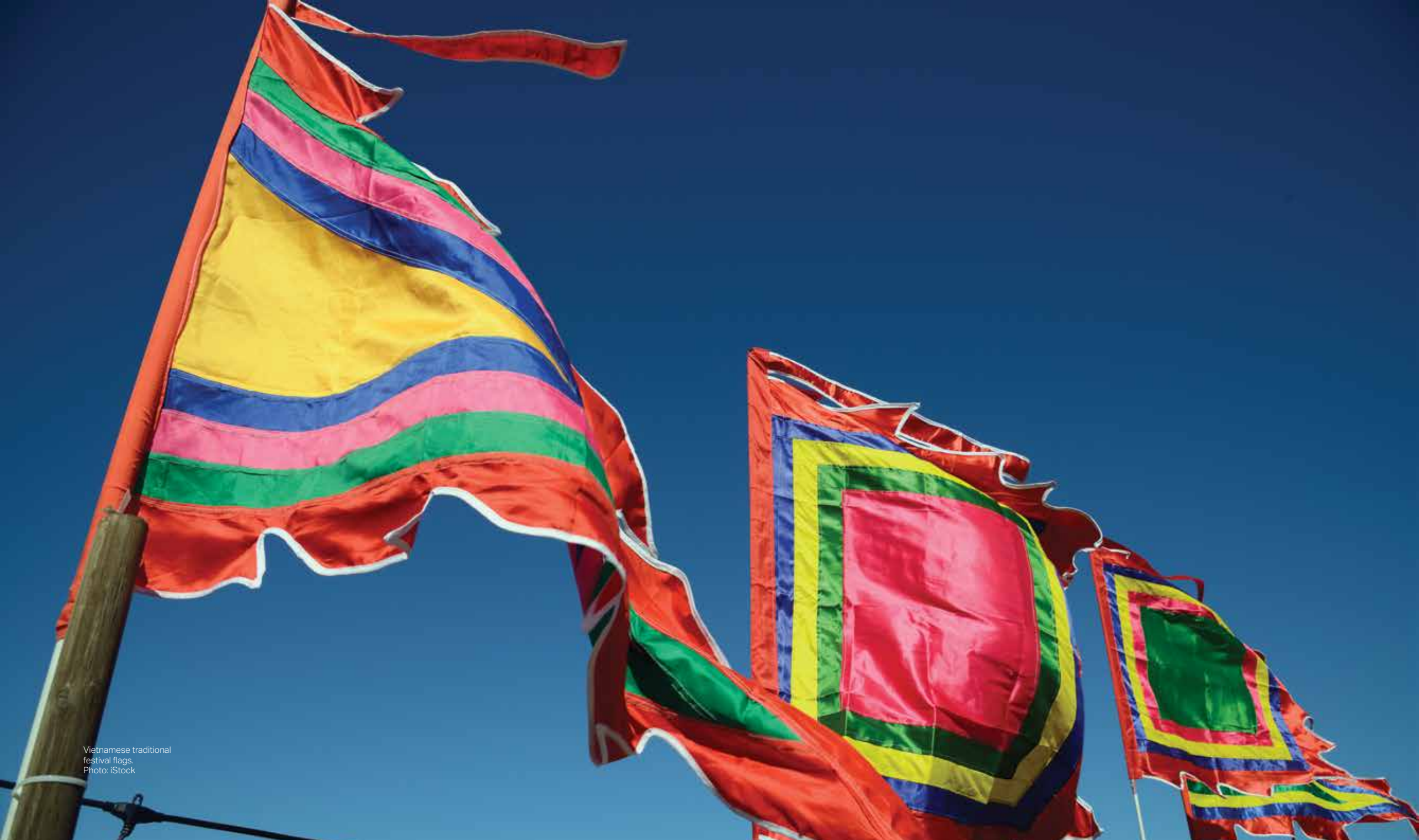
Vietnamese traditional festival flags.