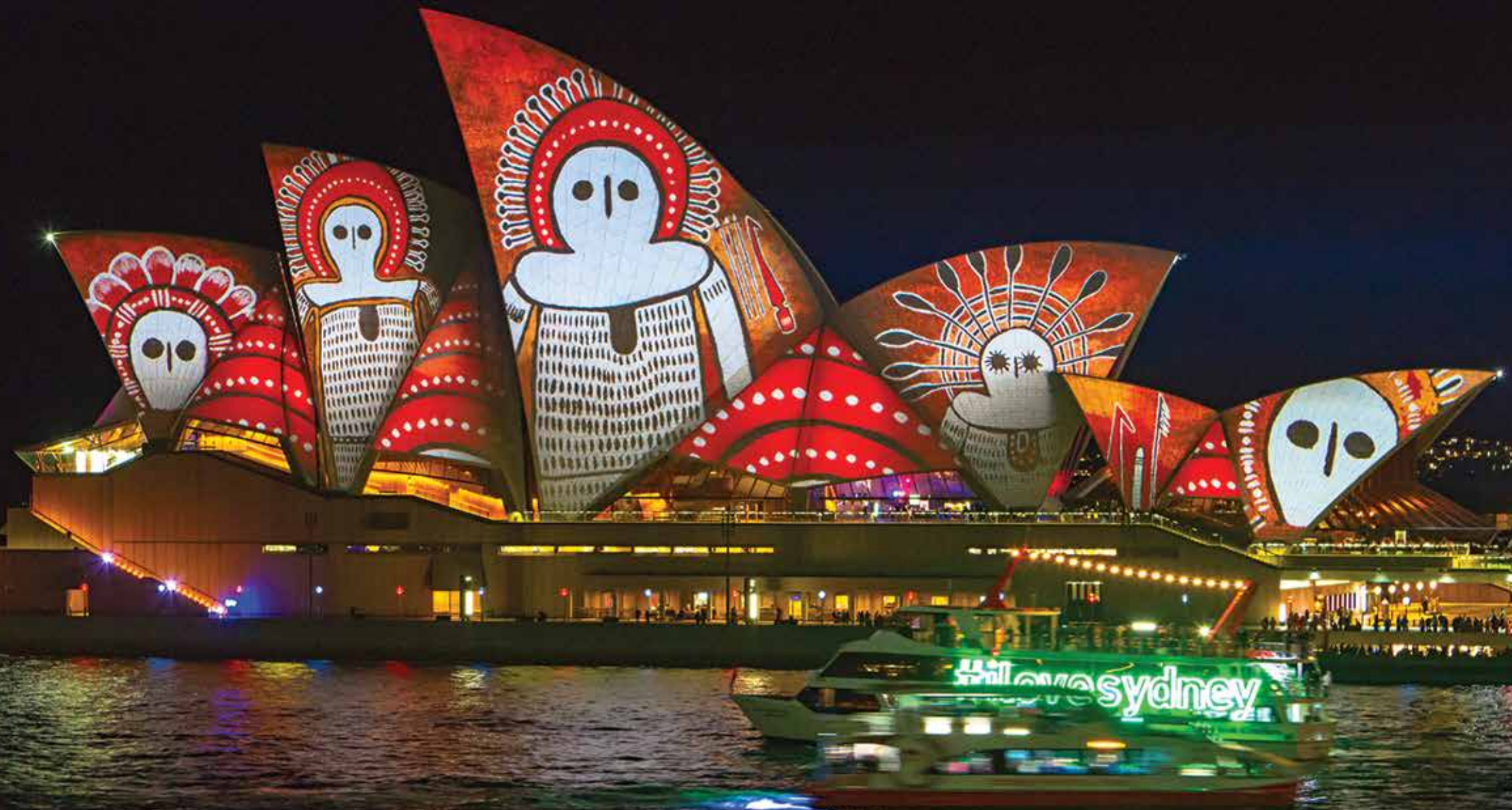
Australian indigenous art projected onto the sails of the Sydney Opera House during VIVID Sydney Festival.

WE INVITE YOU TO CELEBRATE THE FRIENDSHIP AND PARTNERSHIP BETWEEN AUSTRALIA AND VIETNAM.